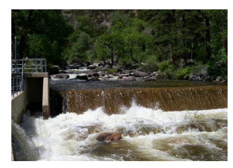
The diversion dam at our Intake Facility in Big Goose Canyon.

All of the water we provide to you comes from creeks, streams, lakes, and reservoirs in the Big Horn National Forest's Big Goose drainage. Sheri-