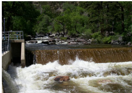
The diversion dam at our Intake Facility in Big Goose Canyon.

All of the water we provide to you comes from creeks, streams, lakes, and reservoirs in the Big Horn National Forest's Big Goose drainage. Sheri-